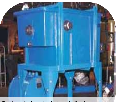
Optional elevated stand discharges oil directly into a reservoir