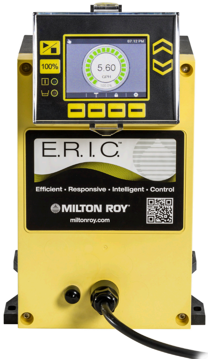
Pictured: Manual model

Selecting the right pump just got easier. No complicated configurations are necessary to find the right pump. With the Manual and Enhanced models offered, simply pick the features that fit your needs (see page 6 for a complete list). Both models offer a wide range of functionality including backlit display, multilanguage, and remote signals to name only a few.