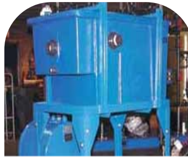
Optional elevated stand discharges oil directly into a reservoir